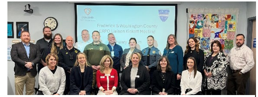
ERPO Kick Off Meeting January 7, 2025

FREDERICK, MD – The Frederick County Health Department (FCHD) is excited to introduce a new Extreme Risk Protection Order (ERPO) Liaison Program to improve the use and impact of ERPOs in Frederick and Washington Counties. This program is made possible by a two-year grant from the Governor's Office of Crime Prevention and Policy.